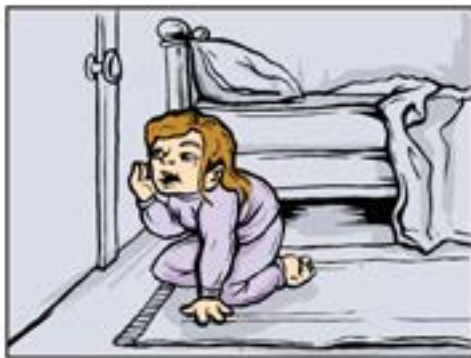
Keeping low, call out to your family.