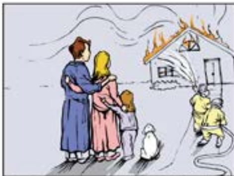
Once outside, go to your family meeting place. Call for help from a safe place. Once you are out, STAY OUT!