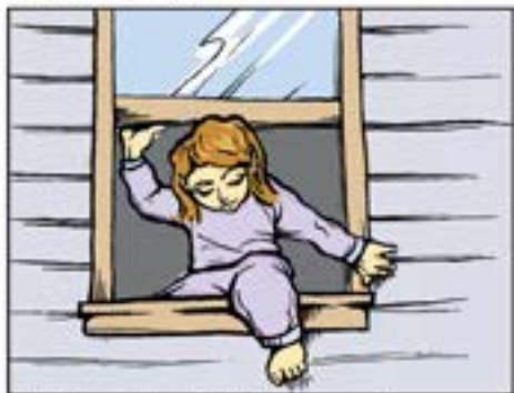
Should the fire have blocked your normal escape route, use your emergency exit.