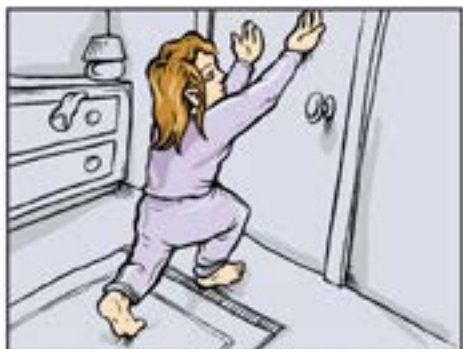
Test the door with the back of your hand for heat. If it is hot, DO NOT OPEN .