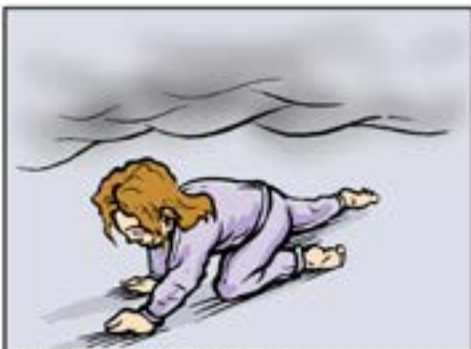
ALWAYS stay low below the smoke.