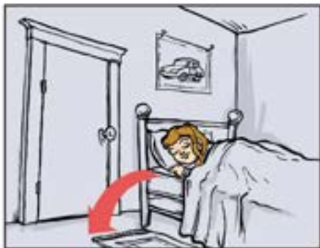
Roll out of bed. DON'T SIT UP.